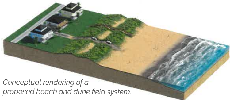
Conceptual rendering of a proposed beach and dune field system.